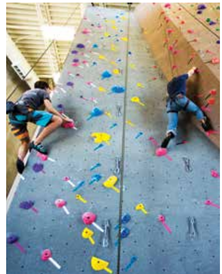
Nebraska's Outdoor Adventure Center opened in 2014 and features a 42-foot rock climbing wall in the heart of campus.