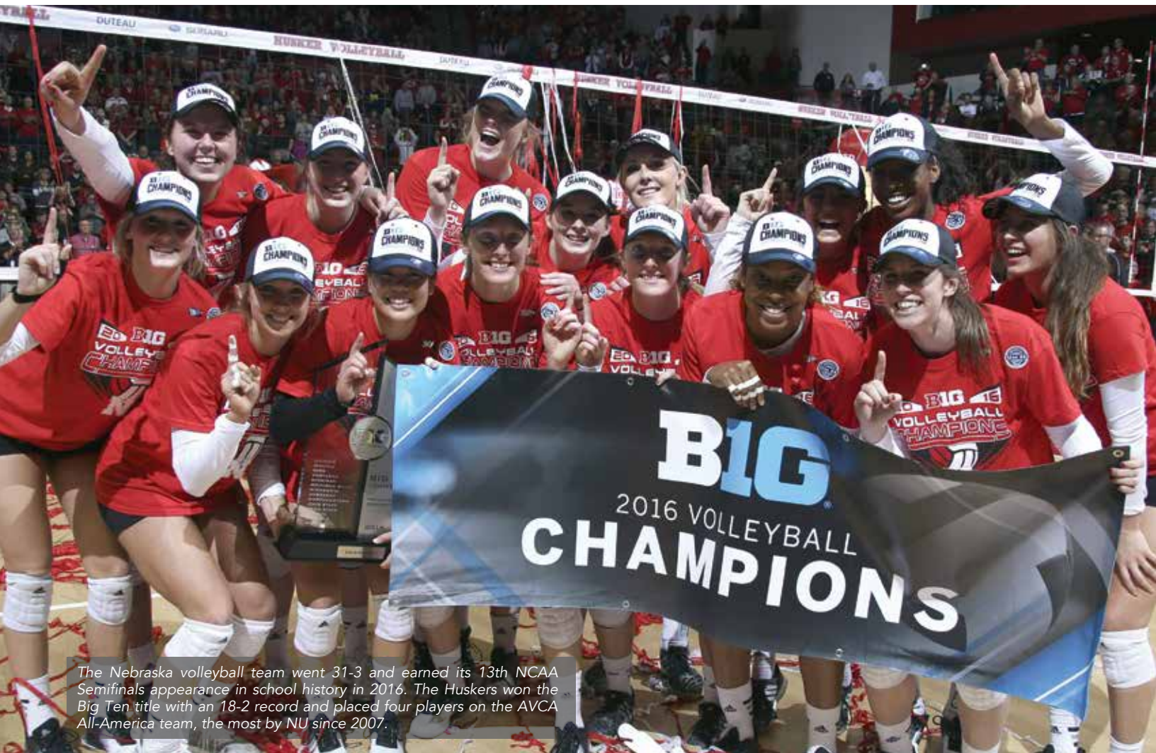
The Nebraska volleyball team went 31-3 and earned its 13th NCAA Semifinals appearance in school history in 2016. The Huskers won the Big Ten title with an 18-2 record and placed four players on the AVCA All-America team, the most by NU since 2007.