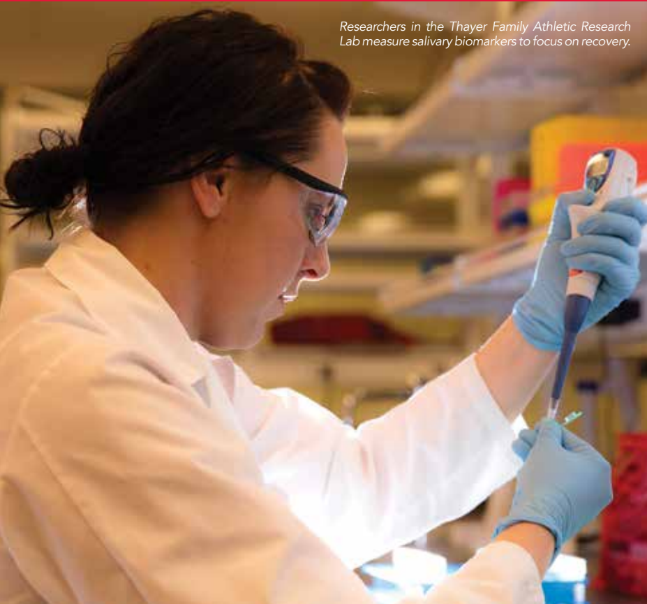
Researchers in the Thayer Family Athletic Research Lab measure salivary biomarkers to focus on recovery.