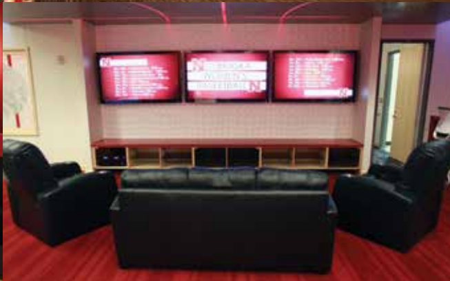
Nebraska's team lounge (bottom right) includes three 65-inch TVs, along with a food preparation area (middle left) that includes a full-size refrigerator and a microwave. The lounge is in between the practice court and video room (bottom left), which includes a wall-sized video screen and 23 theater-style chairs with swivel arm tables.