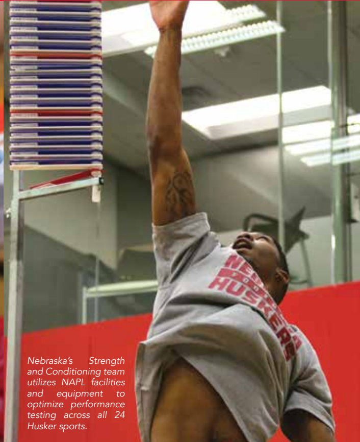
Nebraska's Strength and Conditioning team utilizes NAPL facilities and equipment to optimize performance testing across all 24 Husker sports.