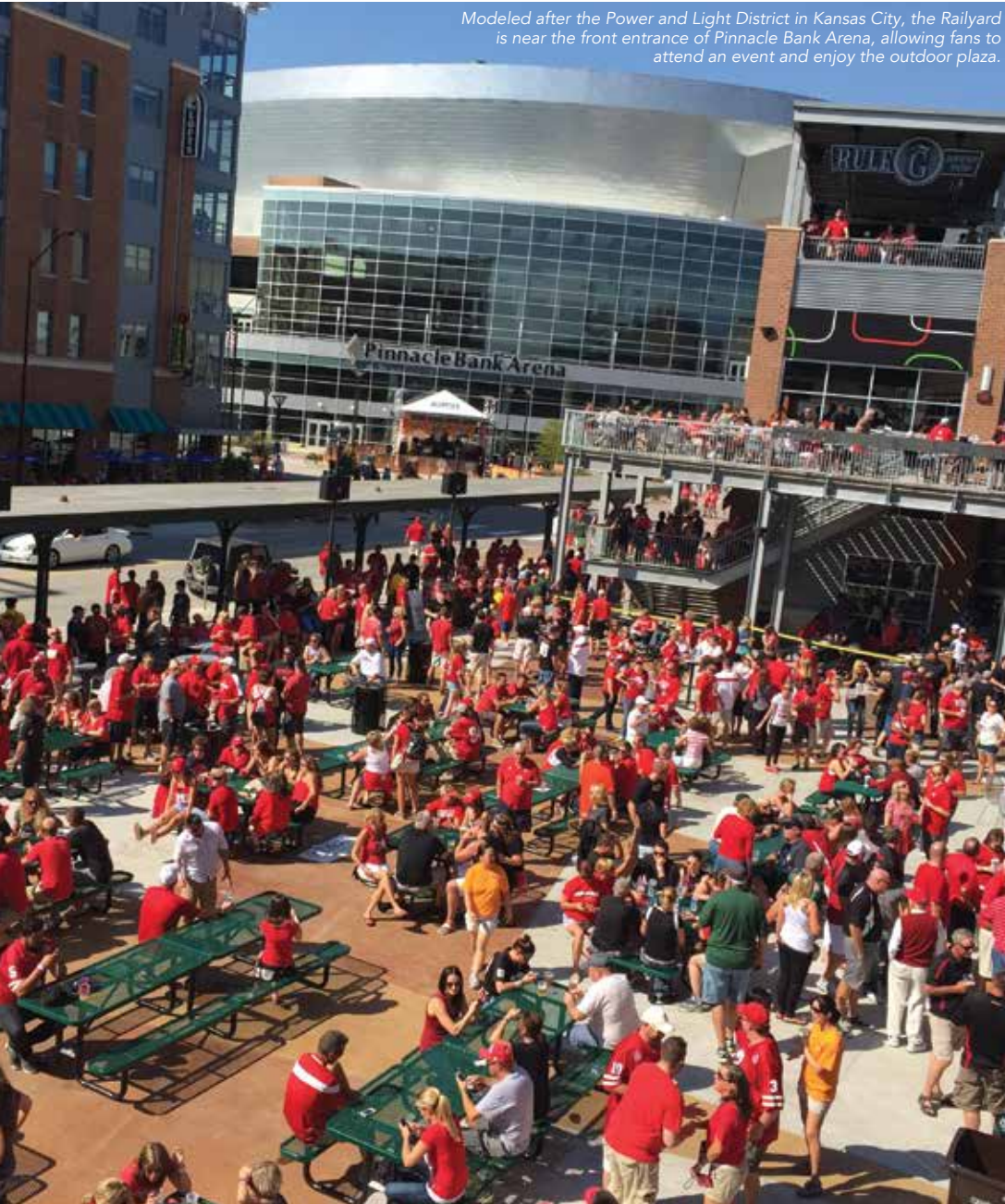
Modeled after the Power and Light District in Kansas City, the Railyard is near the front entrance of Pinnacle Bank Arena, allowing fans to attend an event and enjoy the outdoor plaza.