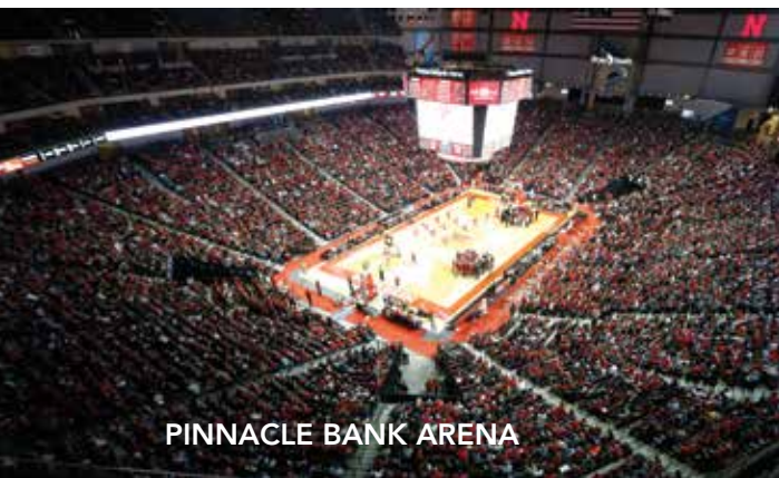
PINNACLE BANK ARENA