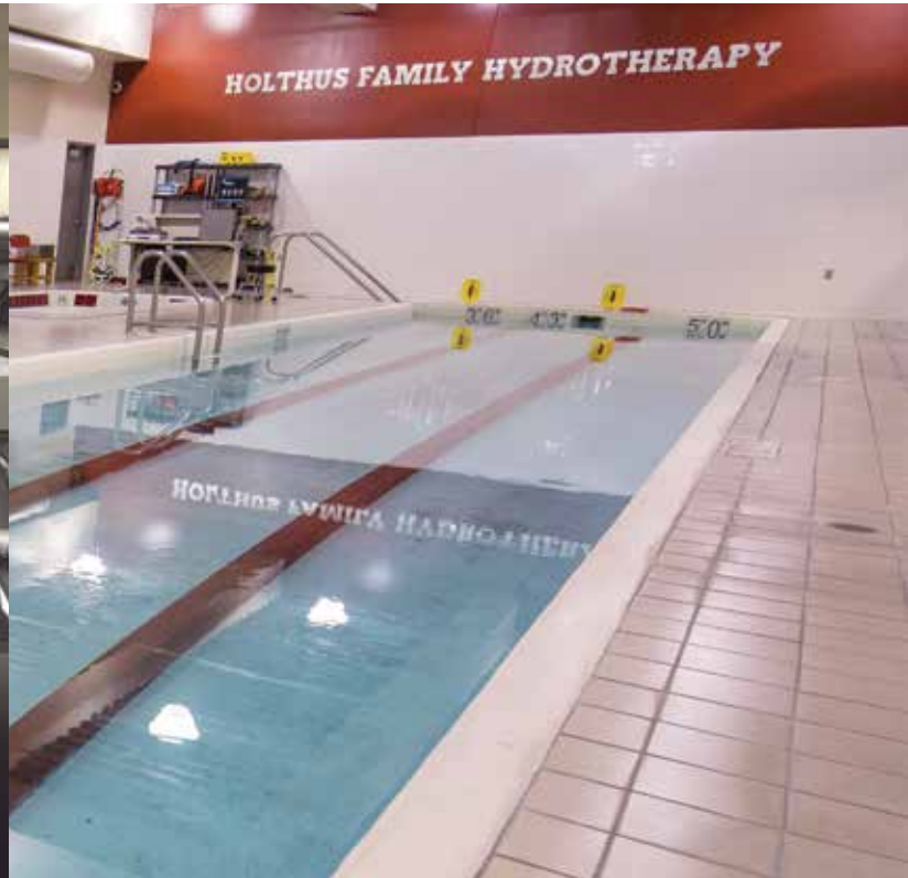
Nebraska's Athletic Medicine Center features a hydrotherapy area that includes a three-level laned pool. The Hydroworx 1000 Treadmill Pool is equipped with two cameras underwater for evaluation and assessment.