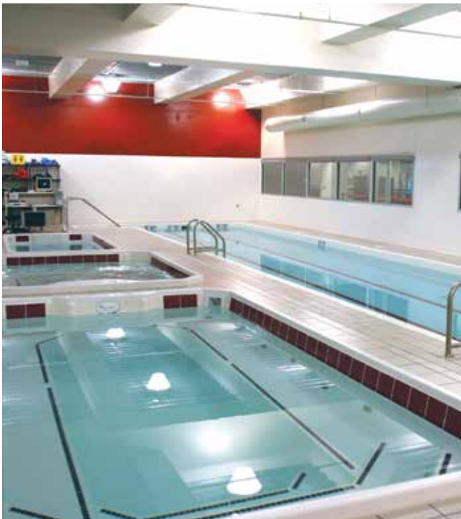
The hot and cold plunge tanks in the Holthus Family Hydrotherapy area help the Huskers recover after workouts and injuries.