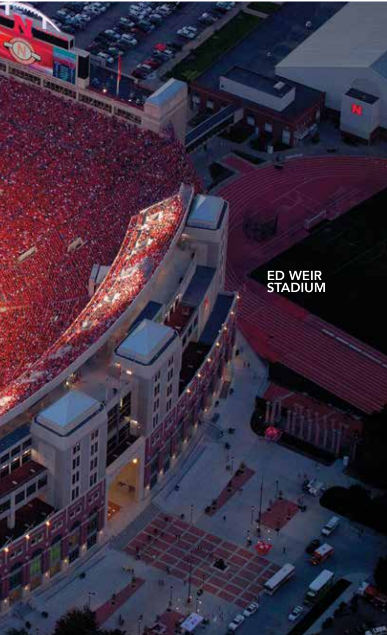
ED WEIR STADIUM