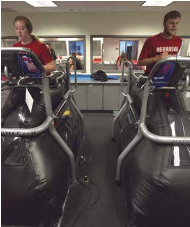
Nebraska uses advanced equipment to help athletes recondition after injury.