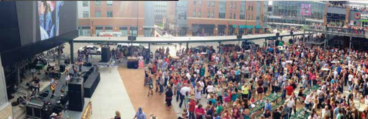
Middle and Bottom: The Railyard entertainment includes a courtyard, an outdoor ice skating rink and a giant 750-square-foot screen known as The Cube.