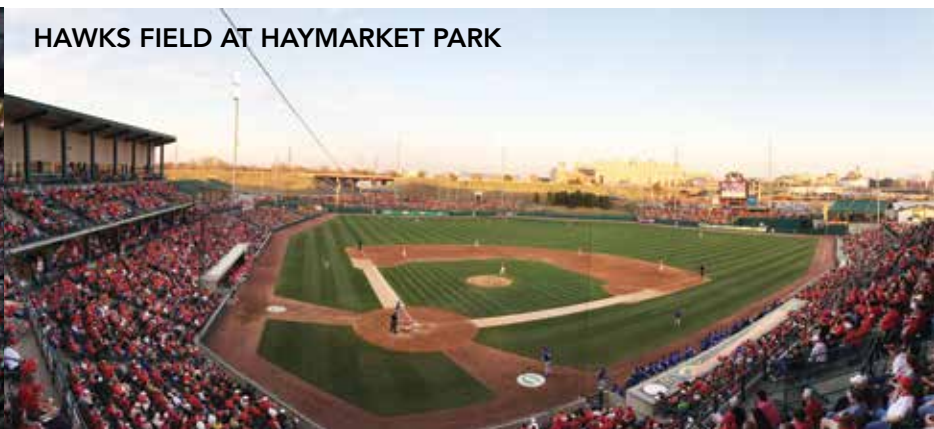
HAWKS FIELD AT HAYMARKET PARK