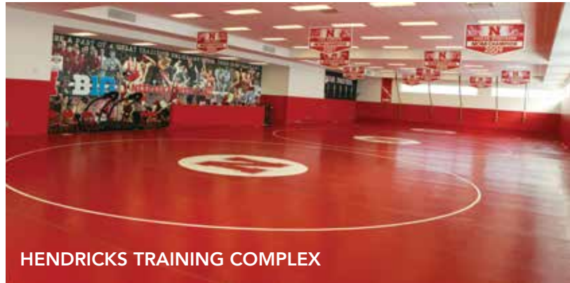
HENDRICKS TRAINING COMPLEX