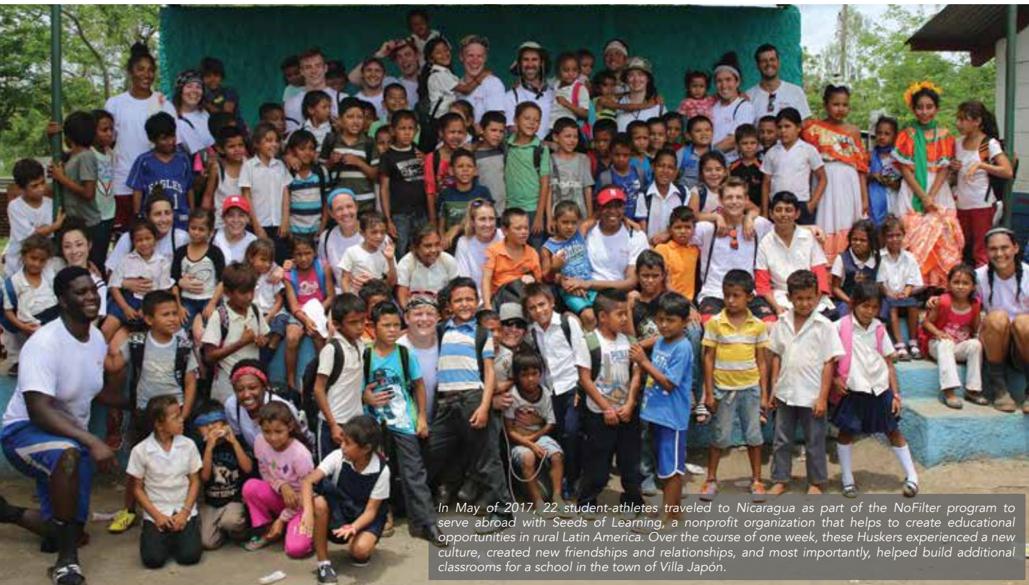
In May of 2017, 22 student-athletes traveled to Nicaragua as part of the NoFilter program to serve abroad with Seeds of Learning, a nonprofit organization that helps to create educational opportunities in rural Latin America. Over the course of one week, these Huskers experienced a new culture, created new friendships and relationships, and most importantly, helped build additional classrooms for a school in the town of Villa Japón.