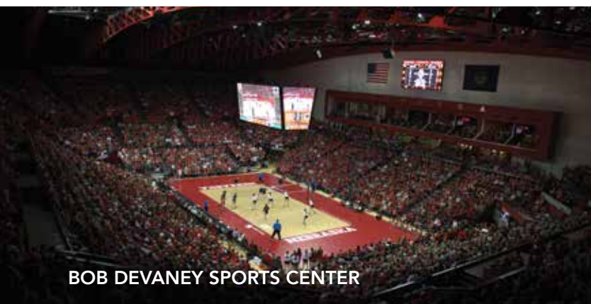
BOB DEVANEY SPORTS CENTER